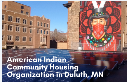
American Indian Community Housing Organization in Duluth, MN