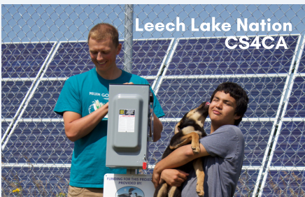
Leech Lake Nation CS4CA

Since 2000, RREAL has been dedicated to making solar energy accessible to communities of all income levels. Through our Solar Assistance program, we provide solar arrays for low-income families and communities as a way to serve more people in need and ensure that everyone can have access to safe, clean, and reliable energy.