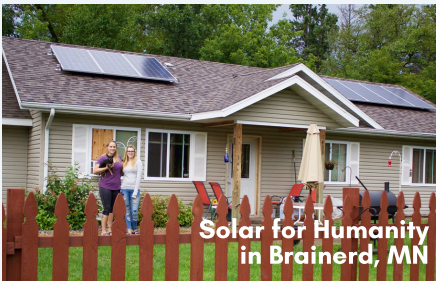
Solar for Humanity in Brainerd, MN

RREAL has a long-term solution to energy poverty— Solar Assistance!