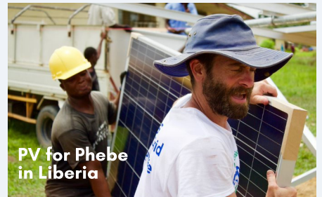
PV for Phebe in Liberia